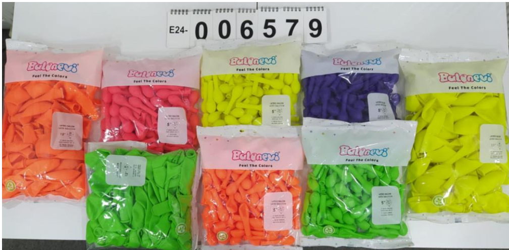
Photo of the Sample